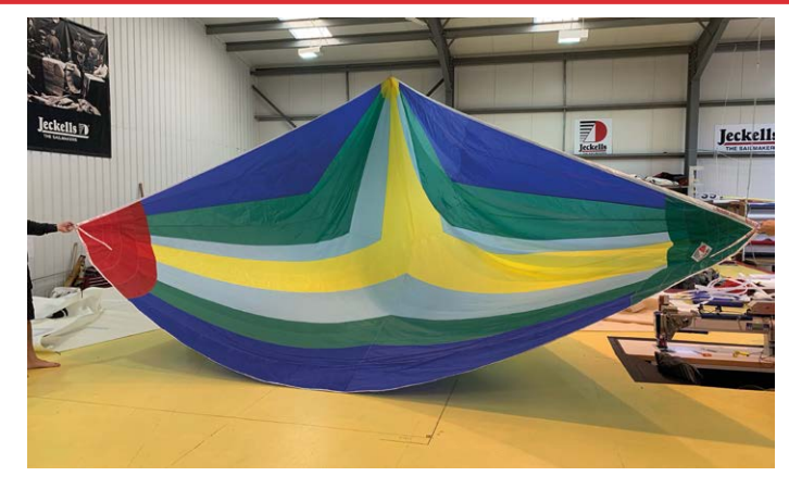
Above, cruising chute ready to be shipped. Below, selecting sailcloth for the laser cutter. Right, materials ready to use and below right, the sewing machine operator sits in a cutout on the loft floor